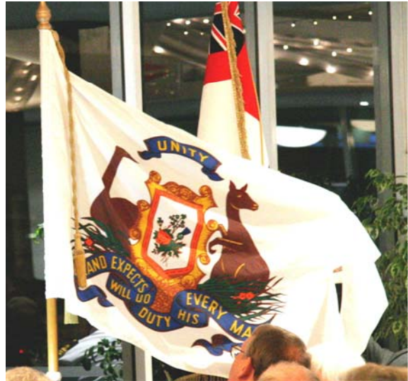
THE BOWMAN FLAG