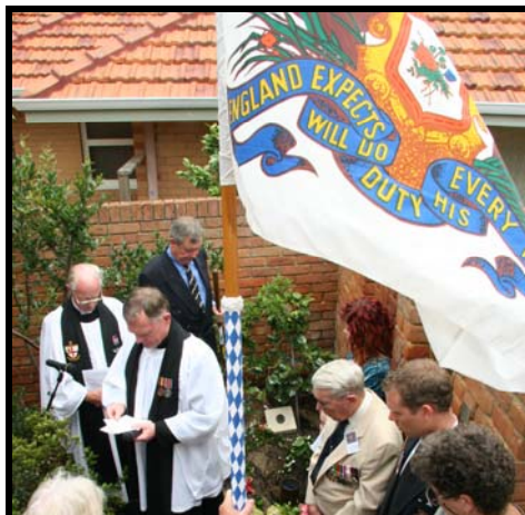
The Bowman Flag flies at the Interment.