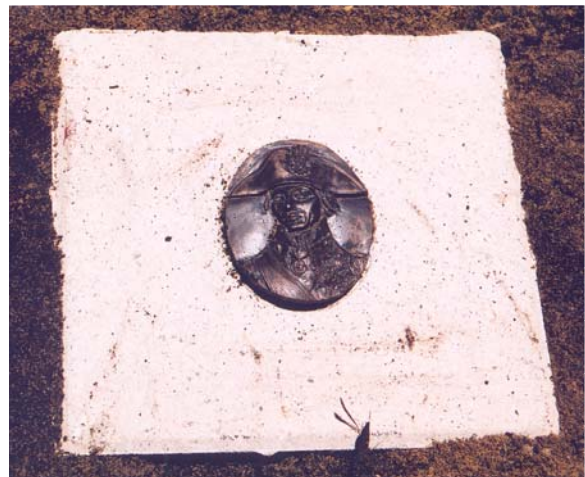
COVER FOR CAPSULE'S INTERMENT