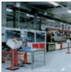
The unique RWE SCHOTT Solar cell process achieves the highest efficiencies in large-scale multi-crystalline cell production