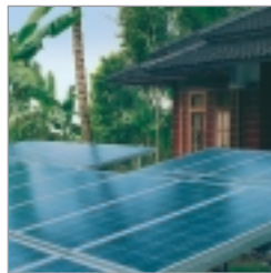
Maximum packing factor and mono-crystalline look for high performance modules

MAIN solar cells offer essential advantages to the module manufacturer: