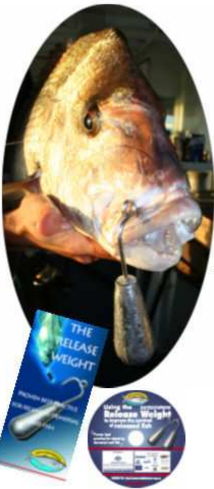
RELEASE WEIGHT DVD & BROCHURE