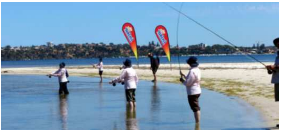
PINK FLYFISHING CLINIC – “FISH AND FLY”