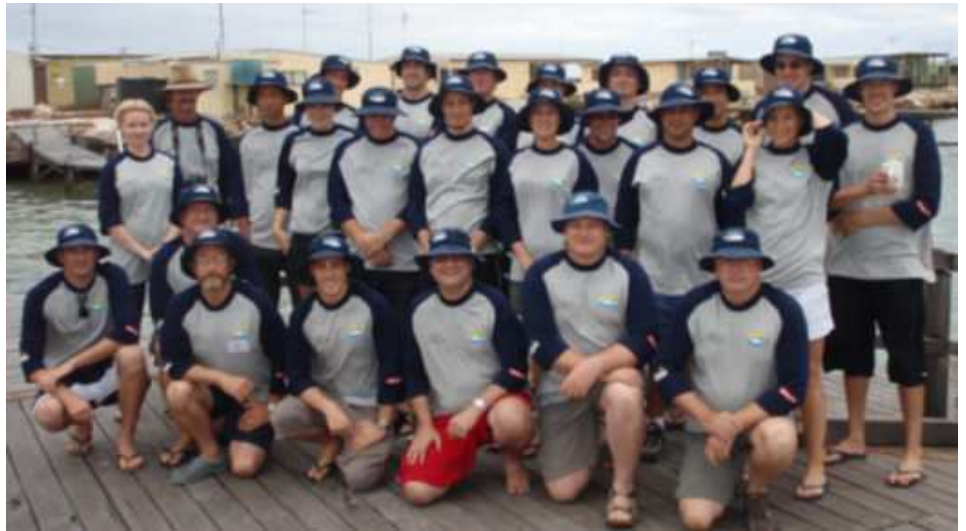
WESTERN AUSTRALIAN YOUNG FUTURE LEADERS PROGRAM